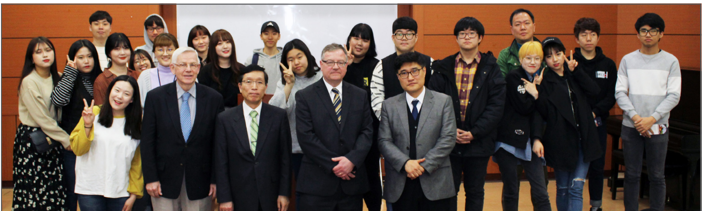
Meeting with students at Yeongnam University and Theological Seminary