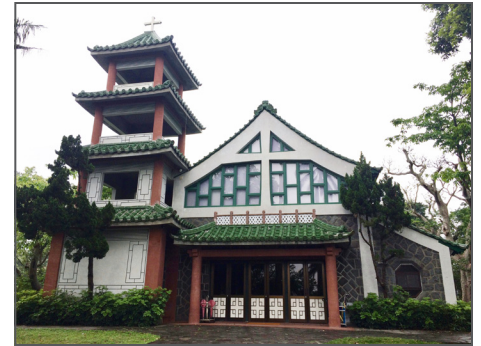
The chapel at Taiwan Theological College and Seminary

I was received with warmth and generosity by the students, staff, and faculty of the Seminary. Aside from teaching I also participated in the seminary's chapel service, played pick-up basketball with students, and shared in conversation and friendship over meals in the cafeteria. As we shared together, we were meeting one another across linguistic and cultural differences, both acknowledging the gap between us yet also seeking to meet one another in the hospitality of Christ.