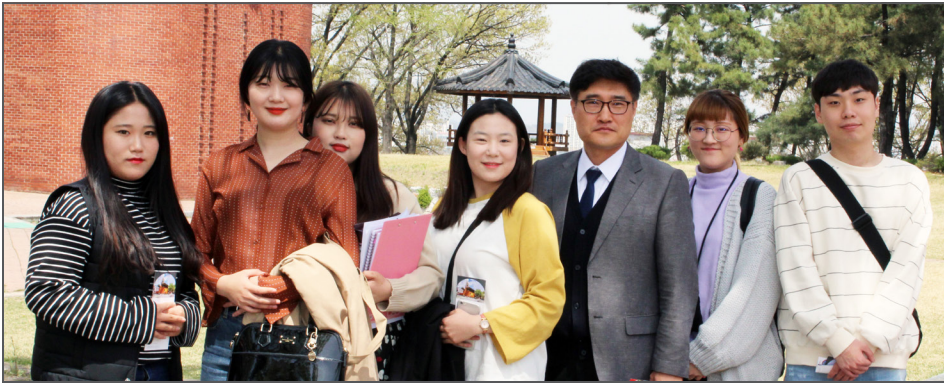
Meeting with students at Yeongnam University and Theological Seminary

university has 2,600 students, more than half of them in the M. Div. program, and the rest in either a Christian Education or Music program. We attended a special anniversary chapel service in honour of the 304 high school students who drowned in the Saewul ferry disaster three years ago. The 1,600 of us in that chapel were moved to tears by the songs and testimonies of a special choir made up mainly of mothers and fathers of those students. One mother described how she had never sought God before her son drowned, but the care, support and love of Christians led her to seek God and to find solace and strength in the good news of Jesus.